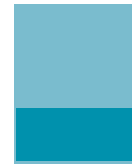
1/3 PAGE HORIZONTAL